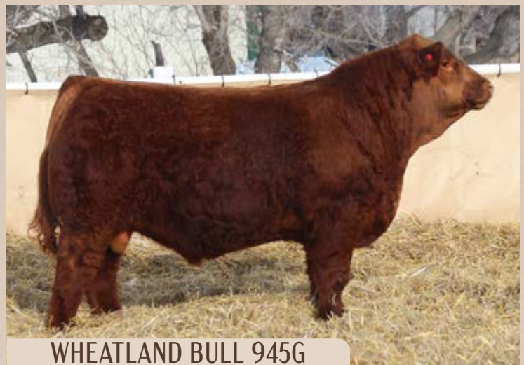
WHEATLAND BULL 945G