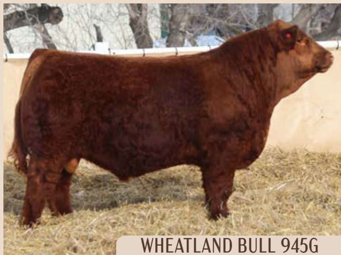
WHEATLAND BULL 945G