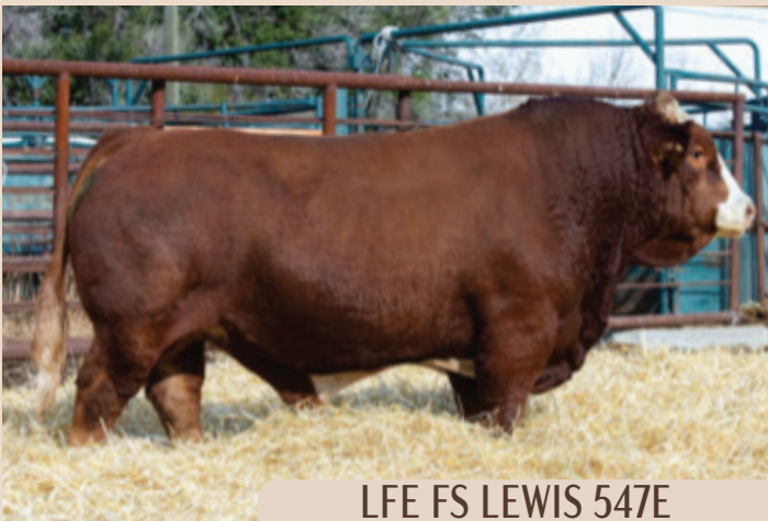
LFE FS LEWIS 547E

15K is one of my picks in the bull pen this year. He also weaned off at 985 lbs. We bought his mother out of Sandy Hill dispersal last fall. If you are looking for a beef bull or one to add pounds to your calves, or a heifer for the replacement pen, have a look at SVS 15K.