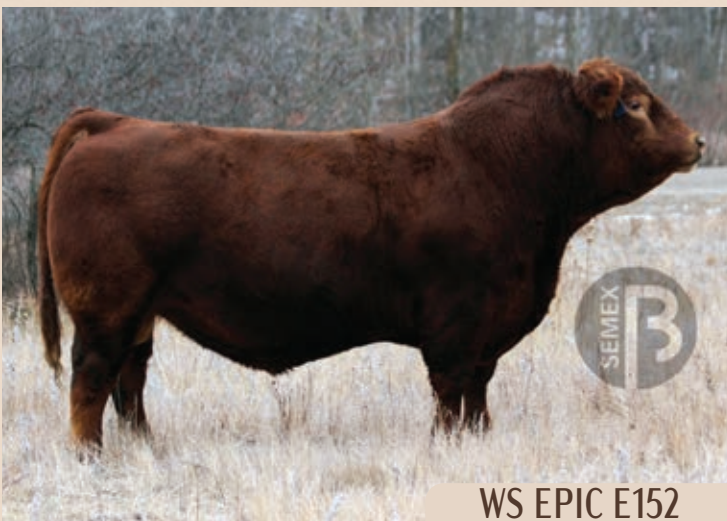
WS EPIC E152

If you are looking for a dark red, deep ribbed, big topped bull with loads of muscle shape, have a look at Sunville Epic. He is mothered by a perfect uddered and good footed Driller daughter. This bull checks all the boxes. Come have a look for yourself.