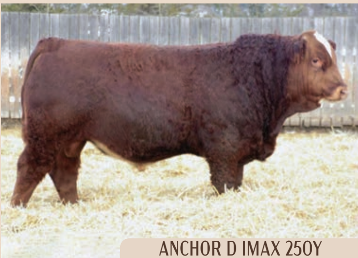
ANCHOR D IMAX 250Y

Where to start with the young herd bull prospect. 47K is sired by none other than Anchor D Imax. The Imax progeny come out easy and have a lot of eye appeal. We purchased 47K's dam from Anchor D Simmentals in the fall of 2021 and she sure hasn't disappointed us.