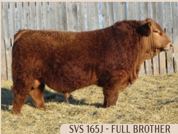
SVS 165J - FULL BROTHER

If you are looking for a bull with loads of hair and muscle shape have a look at 56K. His full brother was one of our high sellers in last years sale.