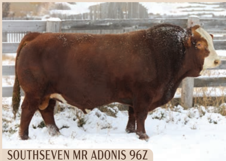
SOUTHSEVEN MR ADONIS 96Z