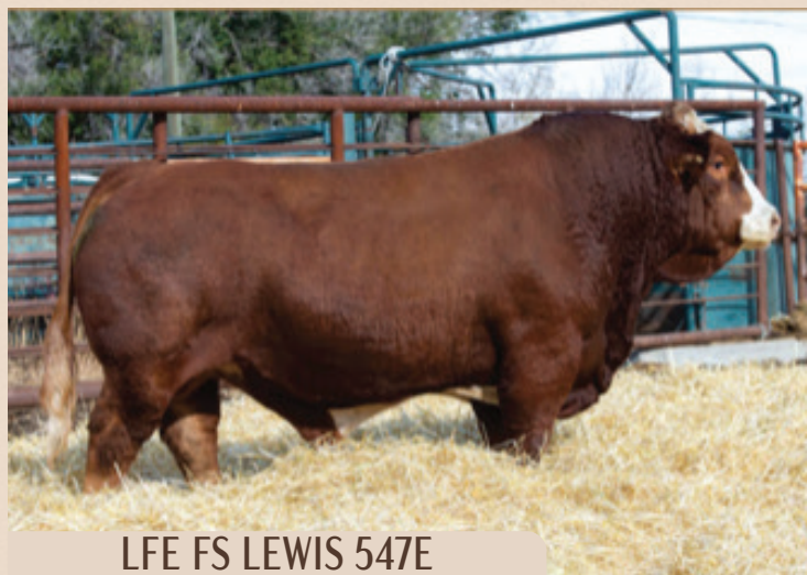
LFE FS LEWIS 547E