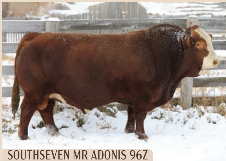
SOUTHSEVEN MR ADONIS 96Z