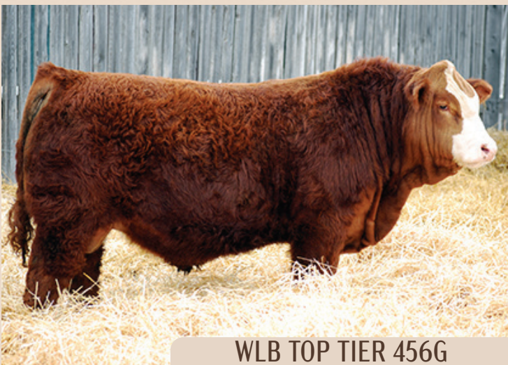
WLB TOP TIER 456G